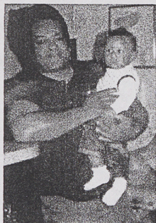
with first grandchild Sixteen (16)